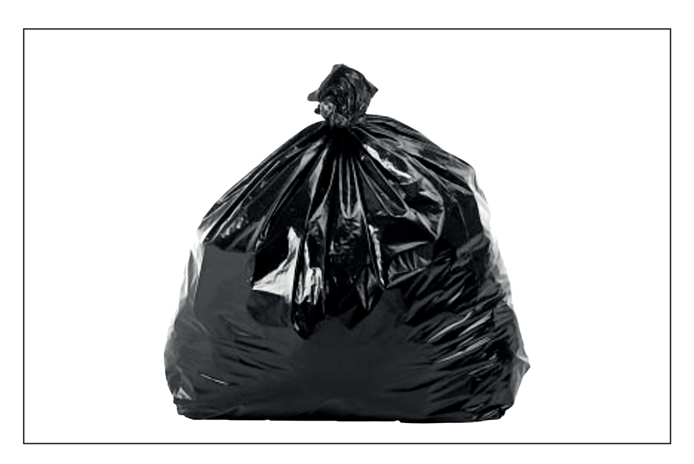
Once the film has finished please put your rubbish in the bin.

If you need some quiet space during the film you can ask to sit in the 'breakout room' for as long as you need to.