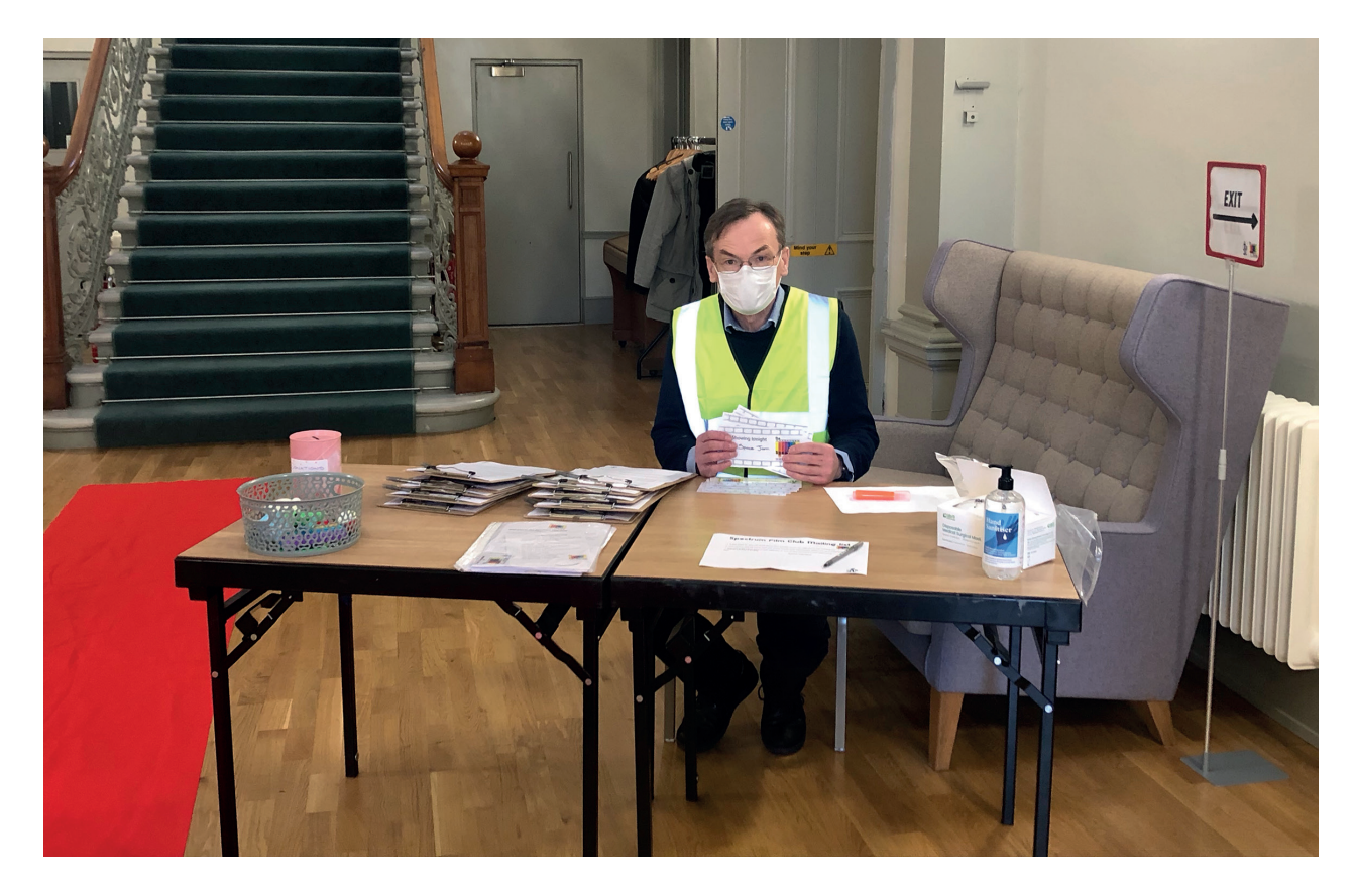
Walk up to the ticket table on your right.