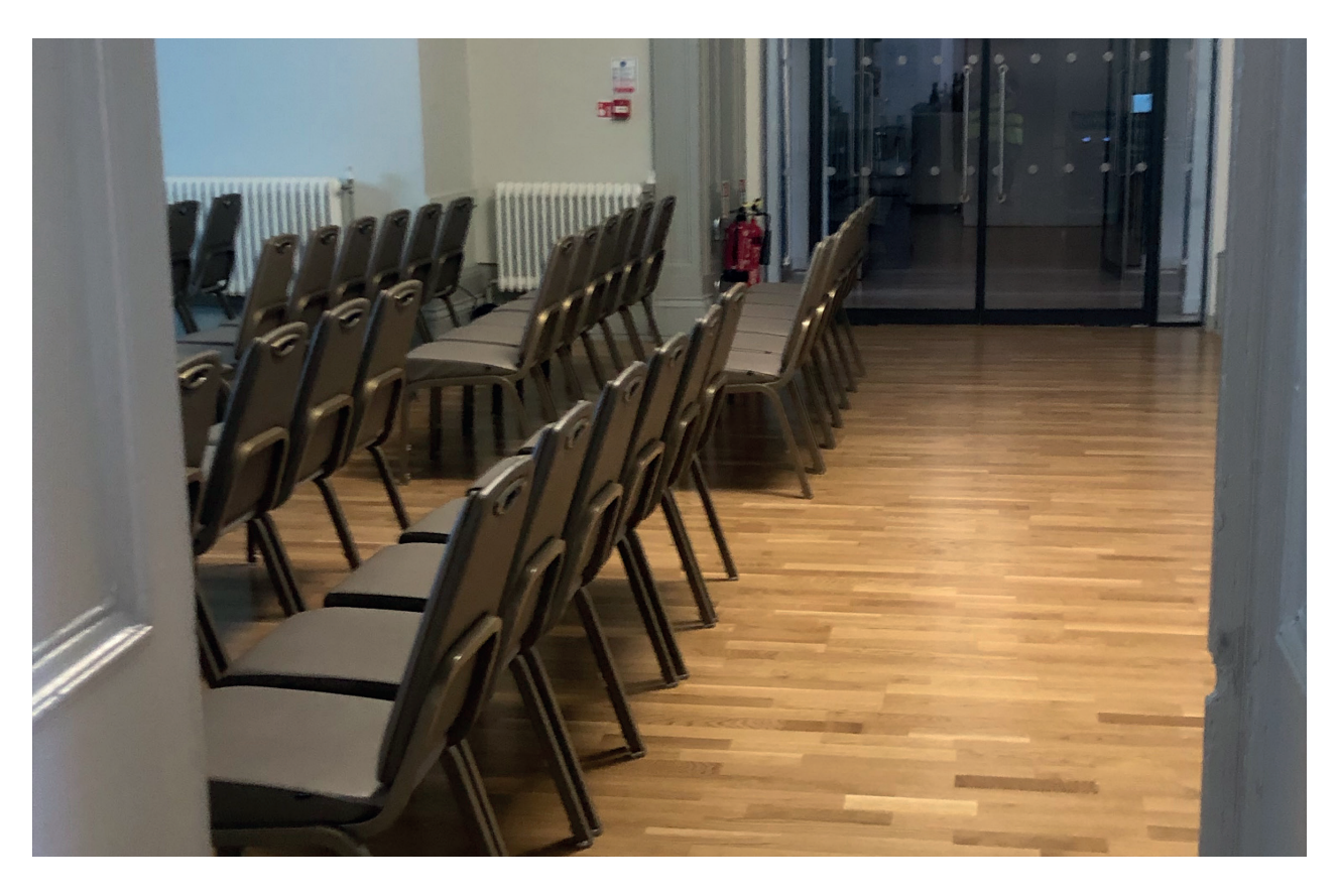
You can then take your seat in the hall.