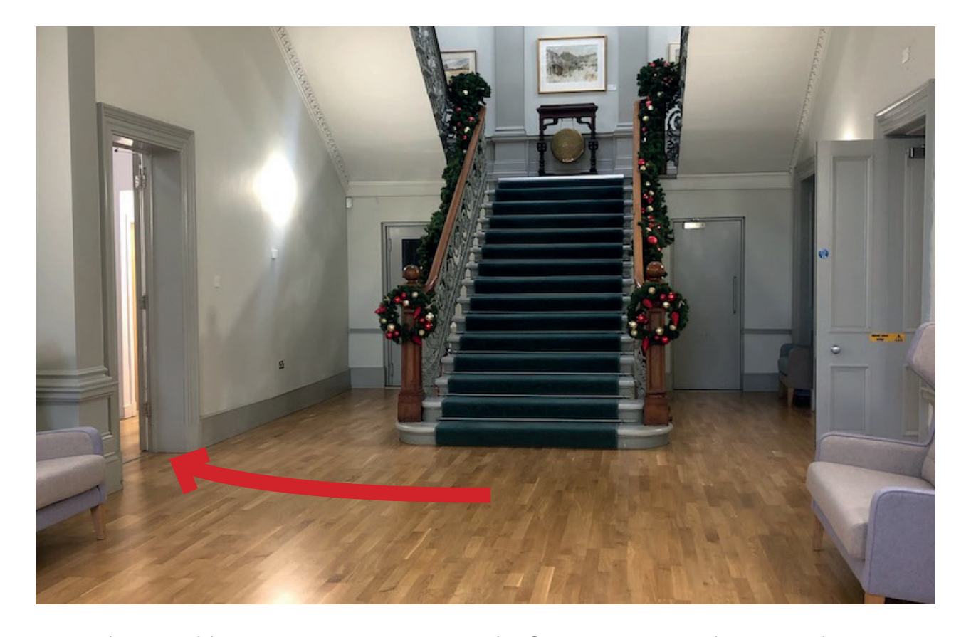
The toilets are on your left next to the stairs. - There are male, female and accessible toilets.