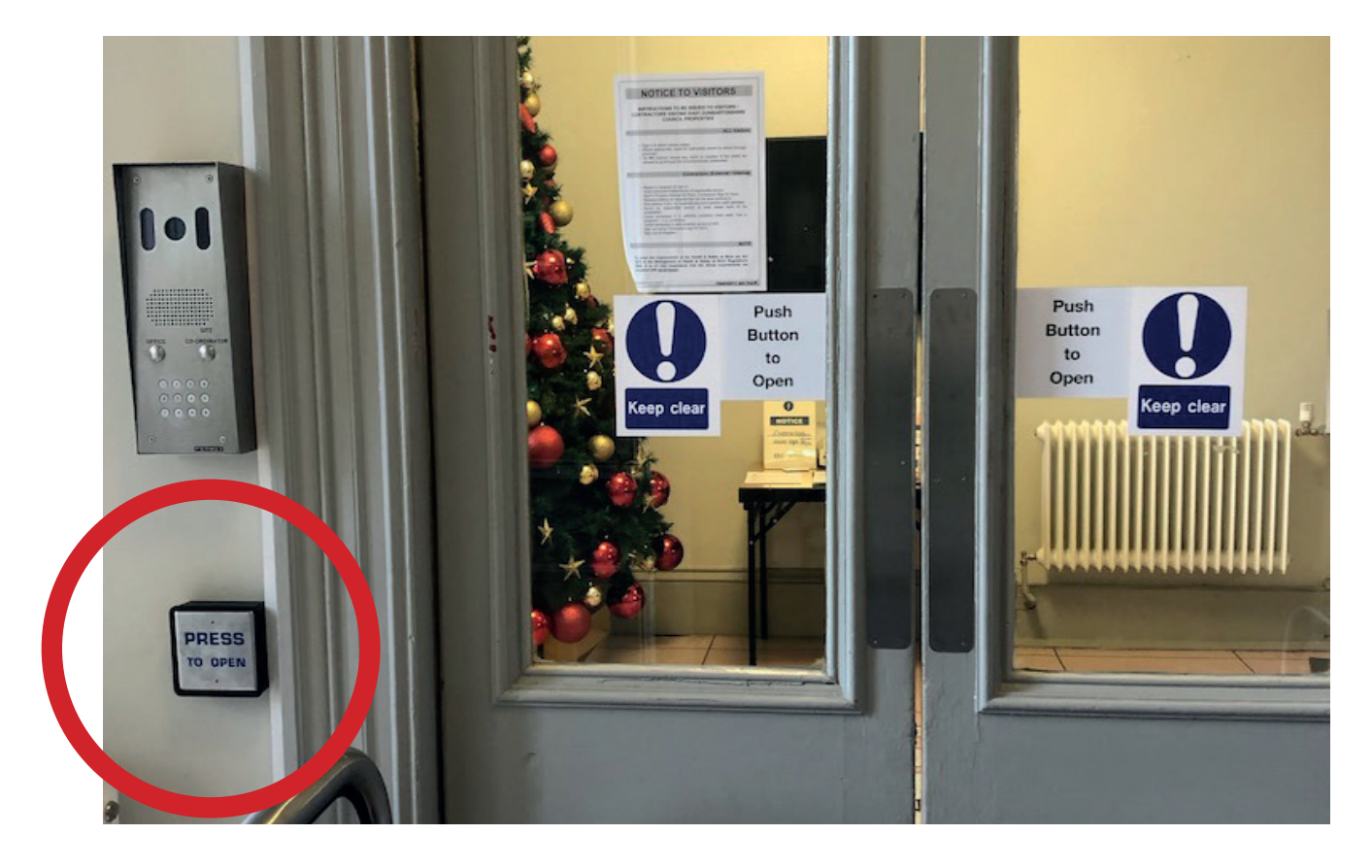
There are automatic doors on your left. Press the square 'PRESS TO OPEN' button.