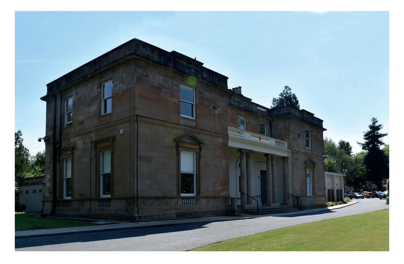
The Spectrum Film Club meets at Kilmardinny House in Bearsden.