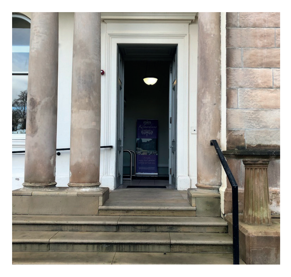
When you arrive, walk through the main door at the front of the building.