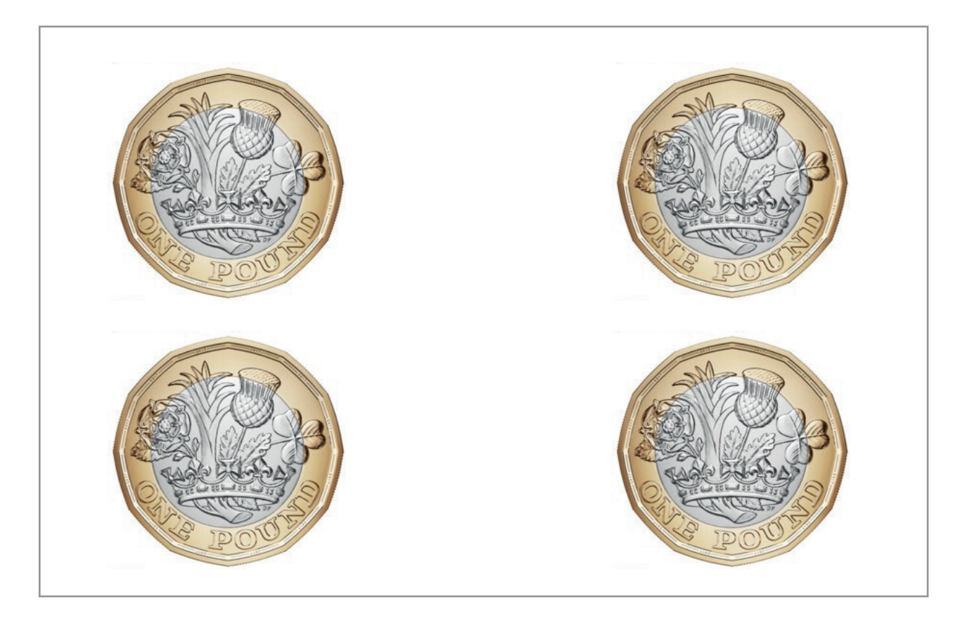
You should pay them £4 for each of your tickets (we don't accept card payments).