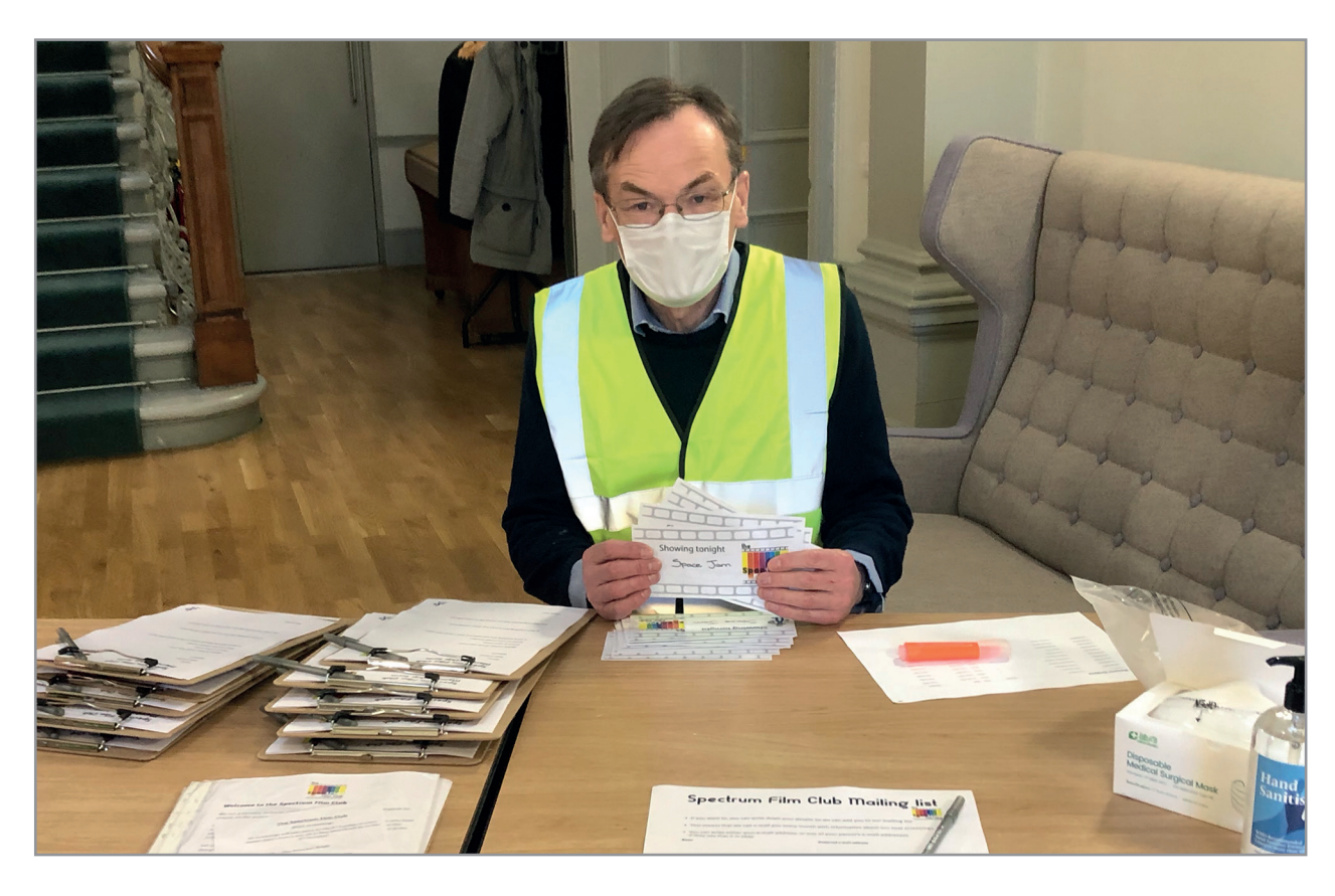
You should tell the staff your name and how many tickets you reserved.