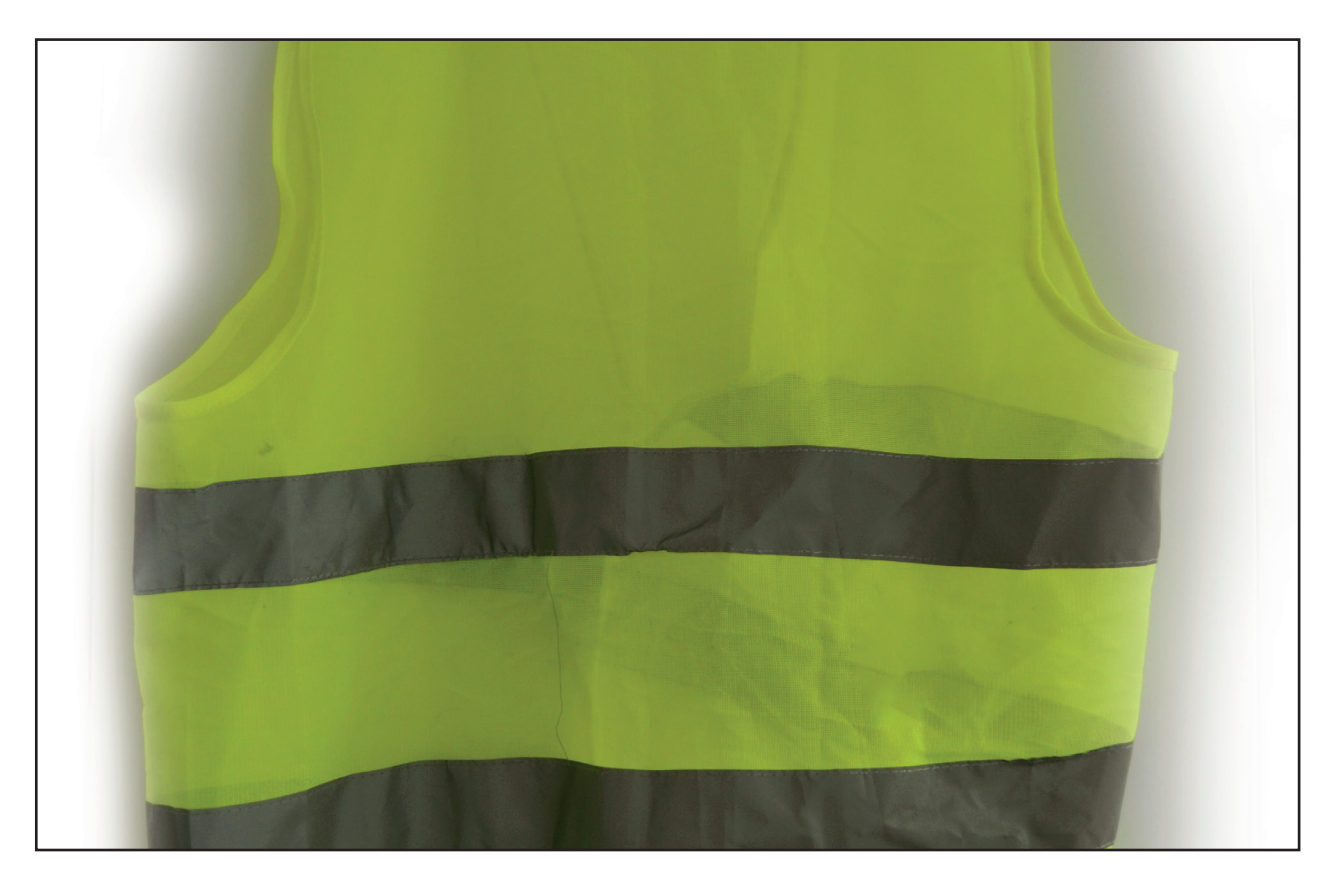
The staff are wearing bright yellow jackets.

If you need any help during the film you can ask the staff.