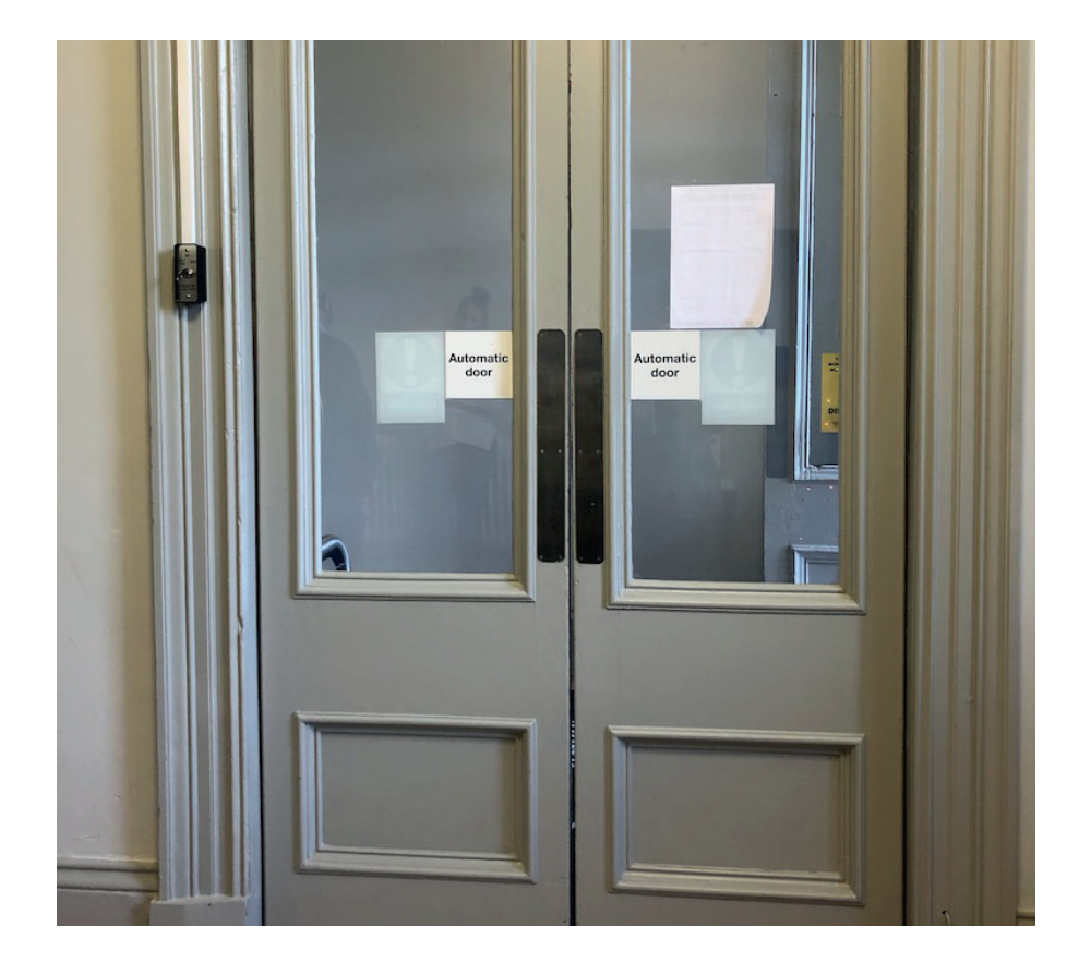
The staff will show you where to leave. It is by the same door that you came in.