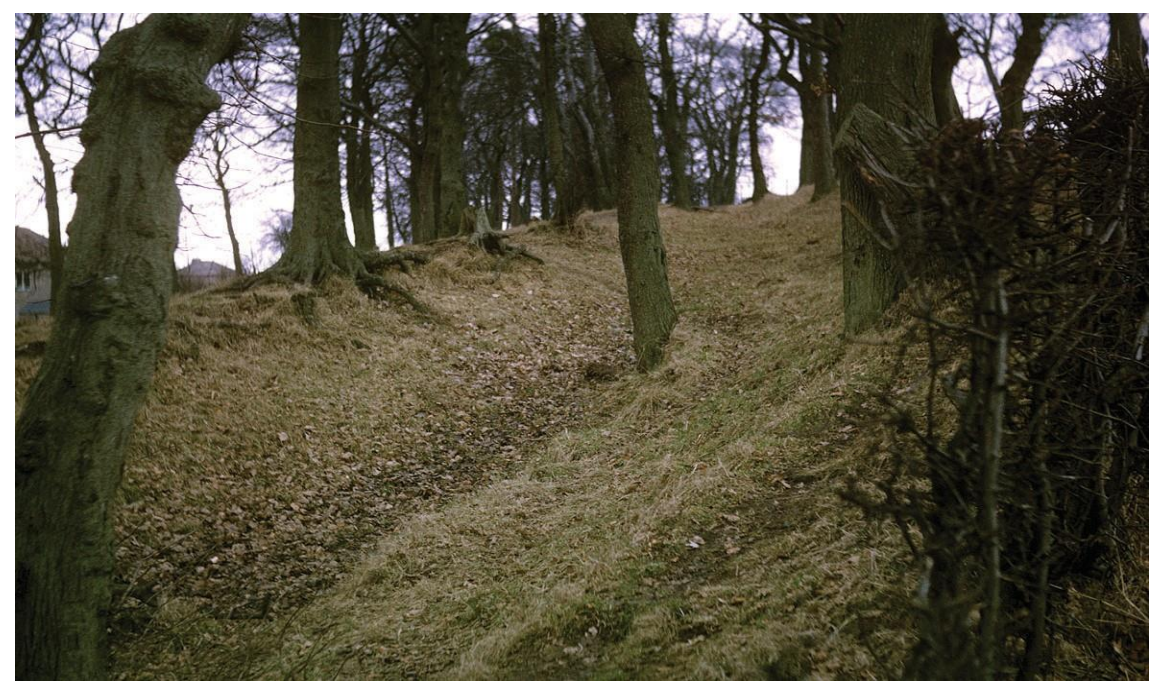
The ditch at Roman Park, Bearsden