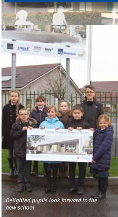
Delighted pupils look forward to the new school

• The name of the contractor who will build the new Bearsden school on the St Andrew's PS site in Bearsden - to replace it and Milngavie's St Joseph's PS - is expected to be announced soon and plans for the new school are on track.