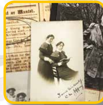
Local History Week from 5 to 12 March

Meanwhile, a range of sporting opportunities are available at Allander Leisure Centre, Kirkintilloch Leisure Centre and Bishopbriggs Leisuredrome.