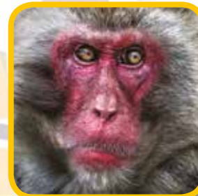
Scottish Photographic Circle