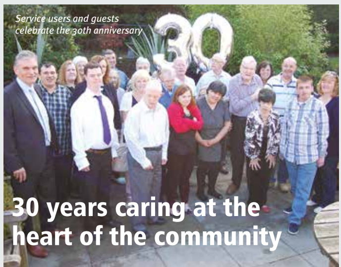
Service users and guests celebrate the 30th anniversary

For more information visit www.eastdunbarton.gov.uk/bearsway