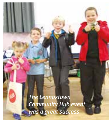
The Lennoxtown Community Hub event was a great success