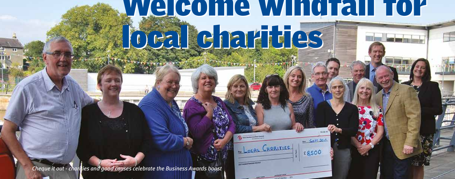
Cheque it out - charities and good causes celebrate the Business Awards boost