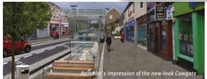
An artist's impression of the new-look Cowgate