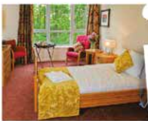
Antonine House Suite