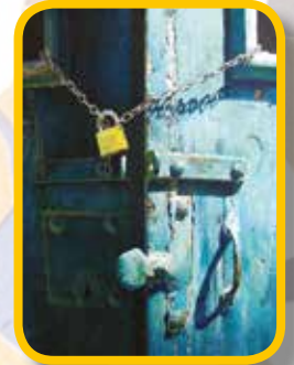
Connections: Scotland and Italy

Visit www.edlc.co.uk and www.eastdunbarton.gov.uk for more information