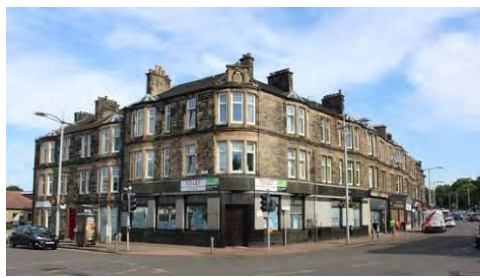
Maintaining a diverse range of units is key to a healthy town centre

2.8 The purpose of a health check is to assess a town centre's overall performance in term of its strengths, weaknesses, vitality and viability. They also provide an understanding of how the town centre changes over time. The most recent health check for Bishopbriggs was carried out in 2016 and you can view the outcomes in a report on the Council's website<sup>4</sup>. Key outcomes are categorised into five main themes, as summarised below