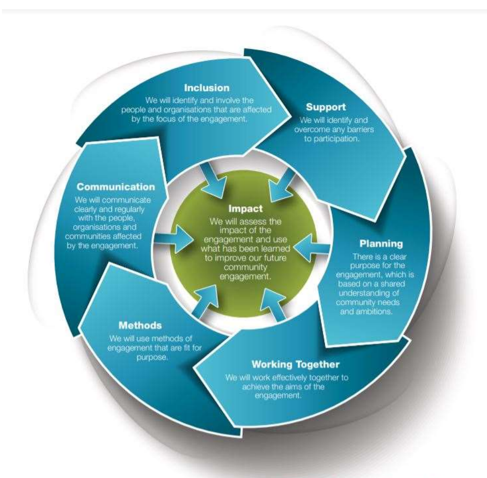
The National Standards for Community Engagement

There are seven national standards for community engagement, defined with supporting guidance in the National Standards publication, which is published on the Scottish Community Development Council website: <a href="https://www.scdc.org.uk/what/national-standards">https://www.scdc.org.uk/what/national-standards</a>