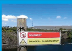
Quarry Action Plan