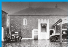
Murdock Barns Project