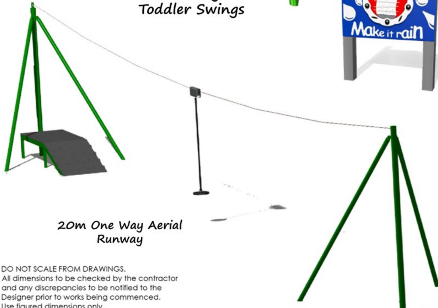
20m One Way Aerial Runway