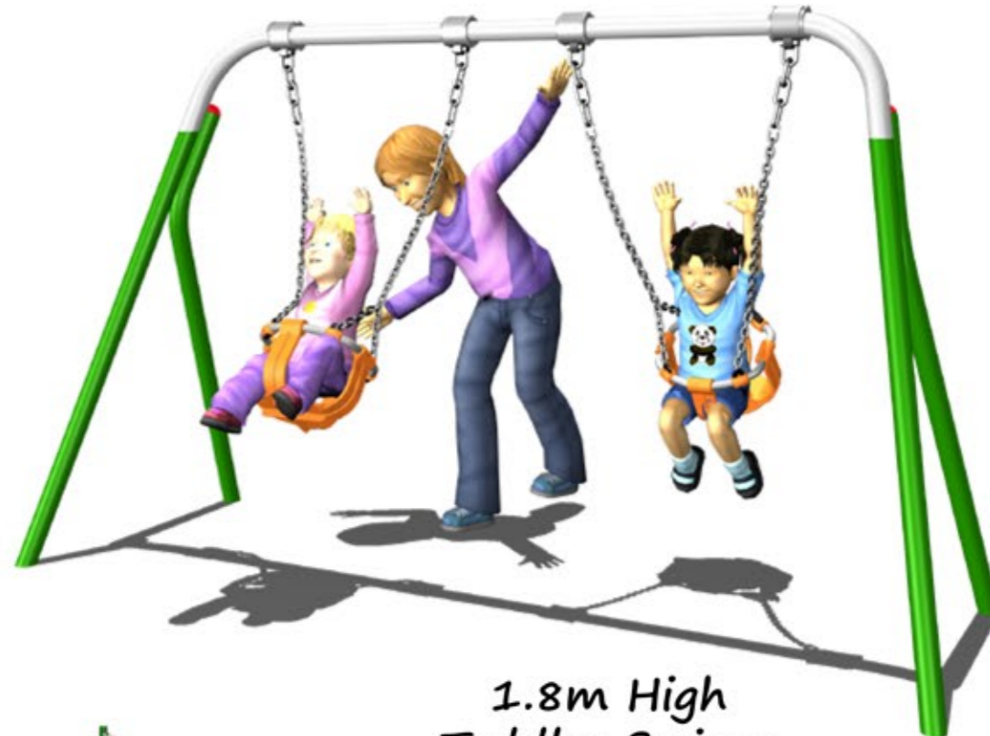
1.8m High Toddler Swings