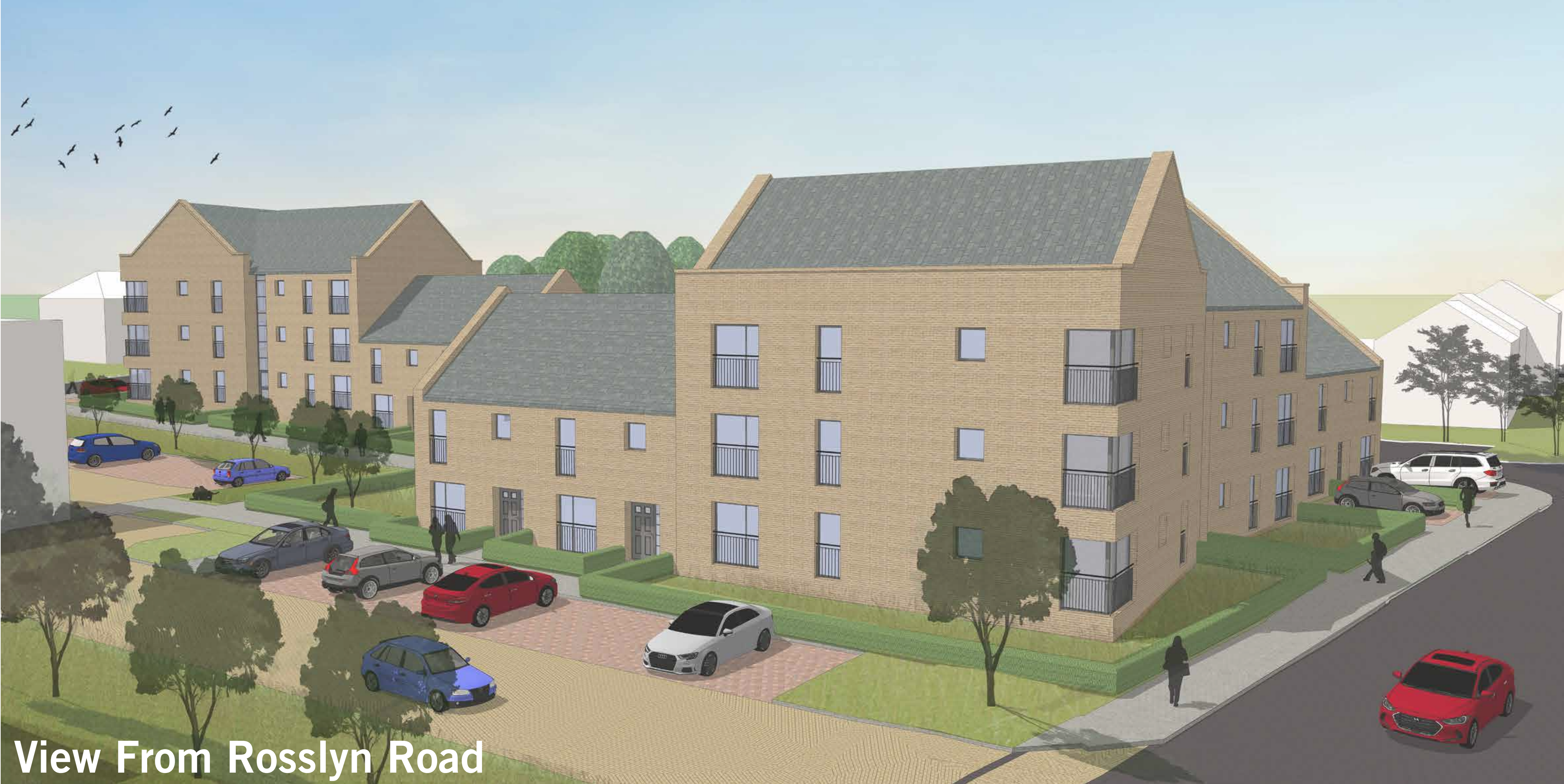
View From Rosslyn Road