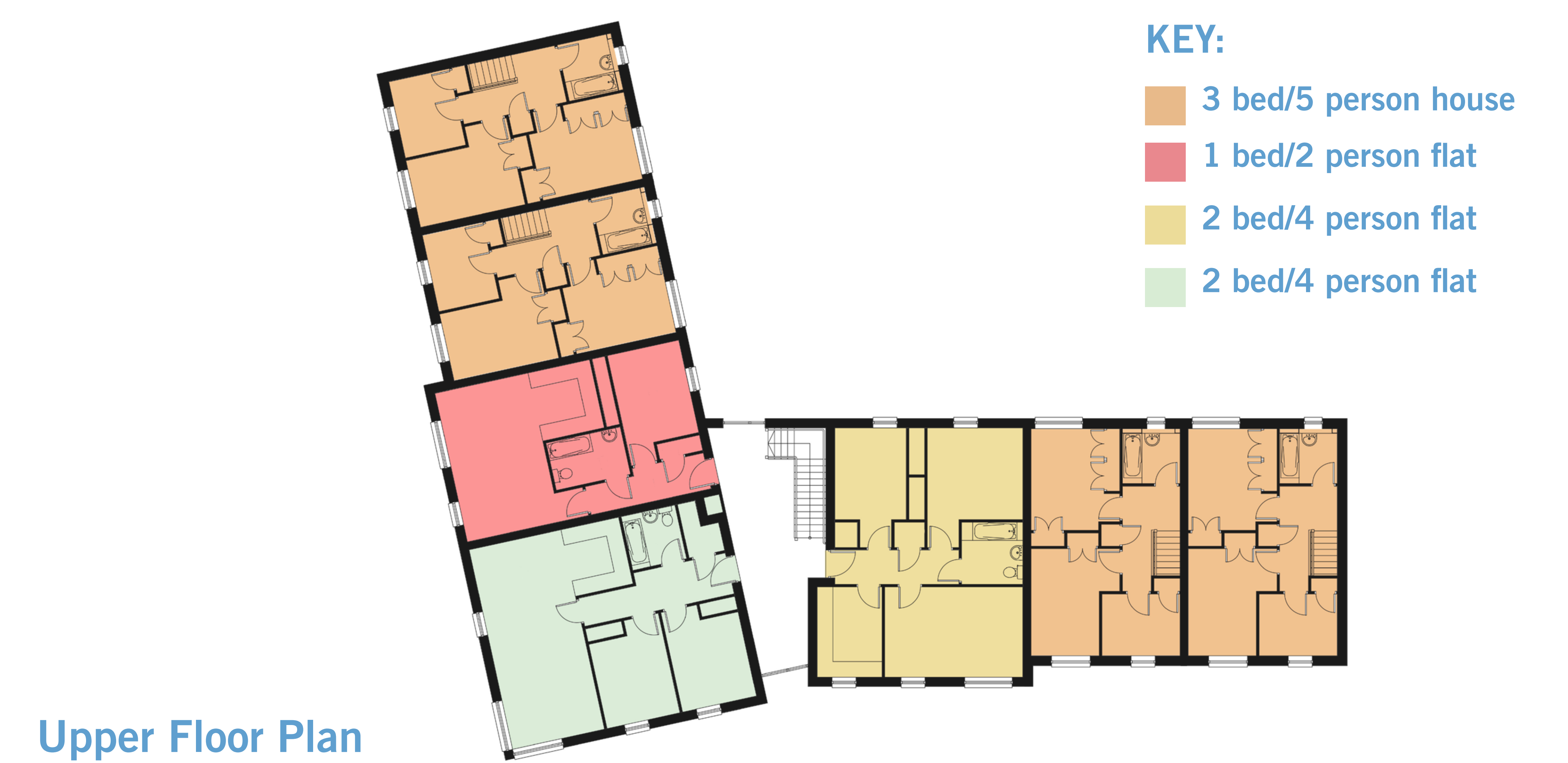
Upper Floor Plan