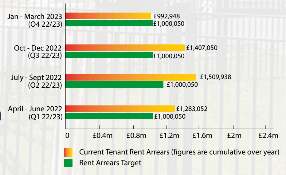
Chart 1: Current Tenant Rent Arrears: Financial Year 2022/23