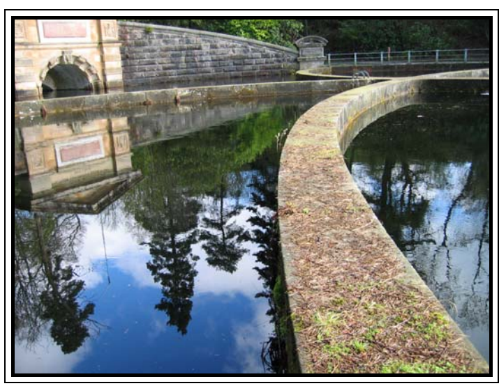
CRAIGMADDIE GAUGE STATION

Note: All preliminary recommendations to be the subject of further discussion and debate through the consultation process on the draft version of the Appraisal.)